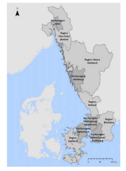
Figure 1. Map of the proposed Scandinavian 8 million City and its 10 administrative regions.

The project clearly reflects the strong interests of the large city-regions - Oslo and Gothenburg, in connection with the construction of an infrastructural corridor that connects the large cities of the region with each other, in order to increase their territorial competitiveness. (COINCO North, 2012) For example, if at the beginning of the project (in 2014), the travel time between Oslo (Norway), Gothenburg (Sweden) and Copenhagen (Denmark) was about 8 hours, by 2021 it was reduced to 4 and a half hours, and by 2025 For the year, there is an expectation that it will only be determined by 2 and a half hours. (Grundel, 2021:863)